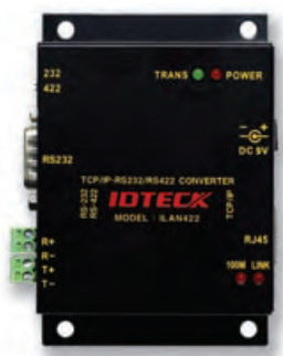
ILAN422 / ILAN485